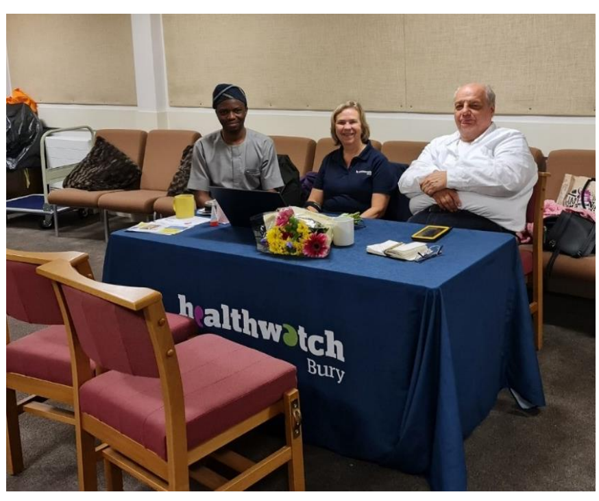
Figure 1 Healthwatch staff and volunteers set up ready for the session

Patient A first attended the Access Assistance & Advice session in February 2022 to request assistance completing a PIP (Personal Independence Payment form). The form was completed and the Patient was successful in his application. He had broken his shoulder several months previously and has no movement in his dominant shoulder, arm or hand, is in constant pain and cannot cook, dress, bathe or prepare