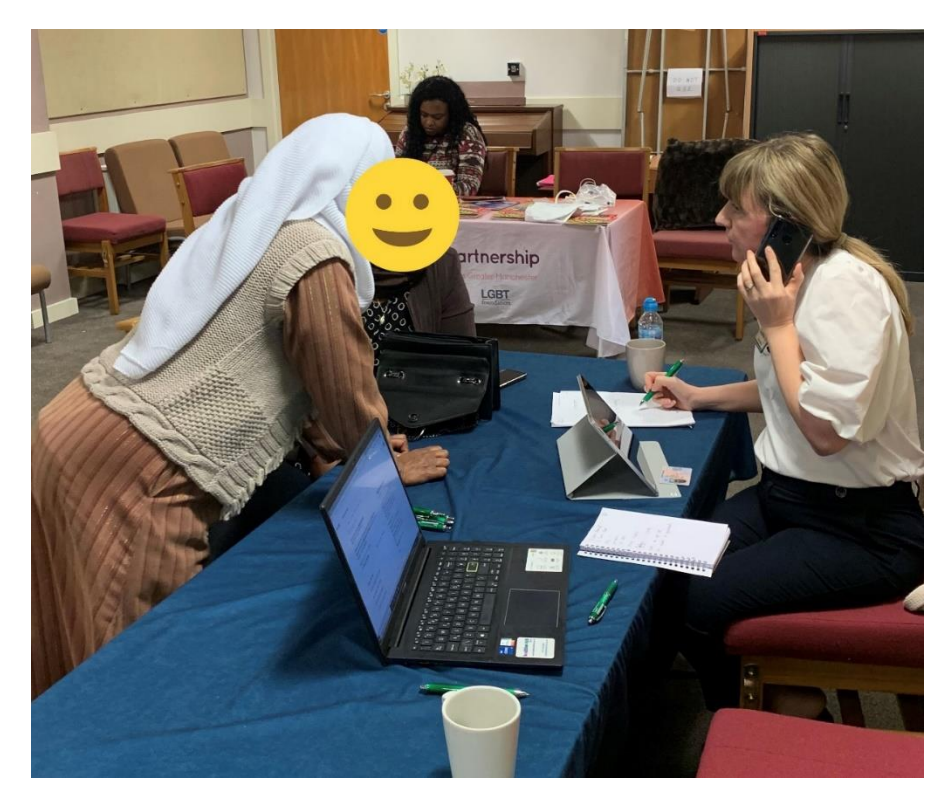
Figure 2 Healthwatch staff assisting with an issue

Healthwatch Bury also contacted Trading Standards and made them aware of this company. They will list as a bogus company. We sent out the contract cancellation email and the company confirmed on the phone they will no longer pursue a payment from Patient A.