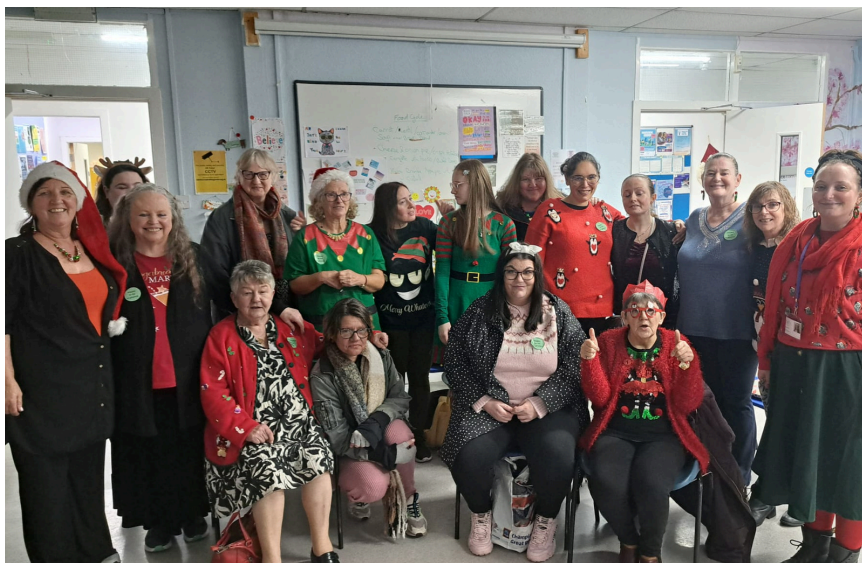
Winter Festival 2024!